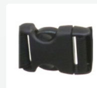
Quick fastening chest strap