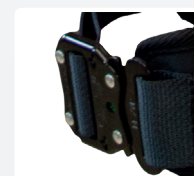
Steel automatic locking buckles on legs